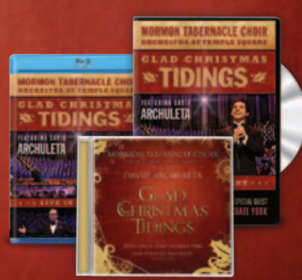
CD available on iTunes®

Deseret Book | Deseret Book.com | 800.453.4532